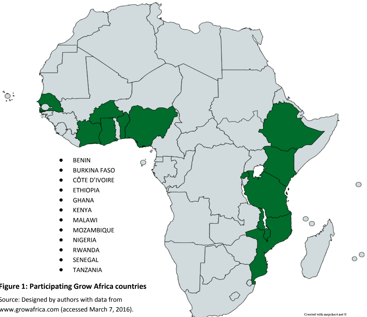
Figure 1: Participating Grow Africa countries